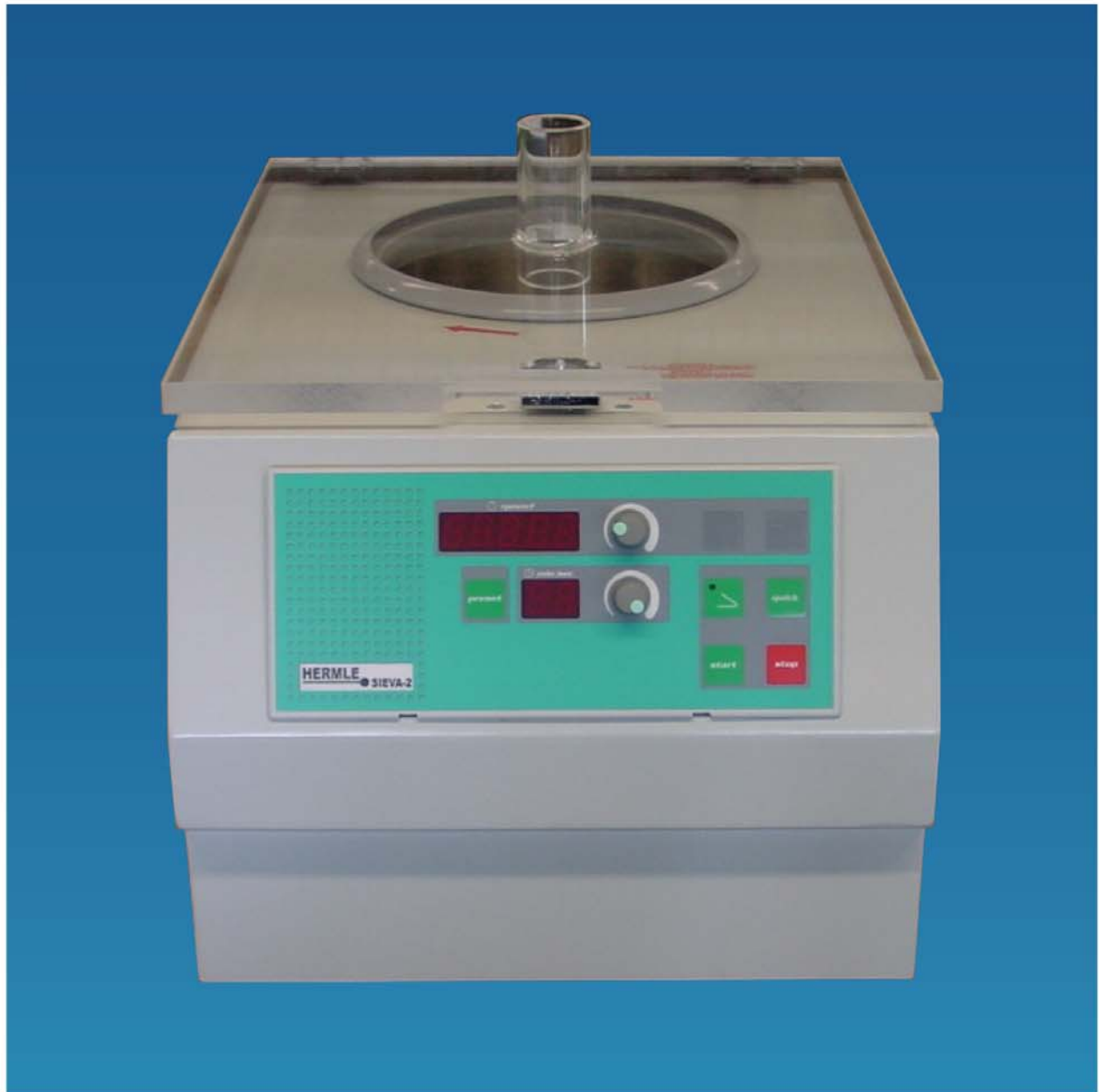
Filtration Centrifuge SIEVA-2